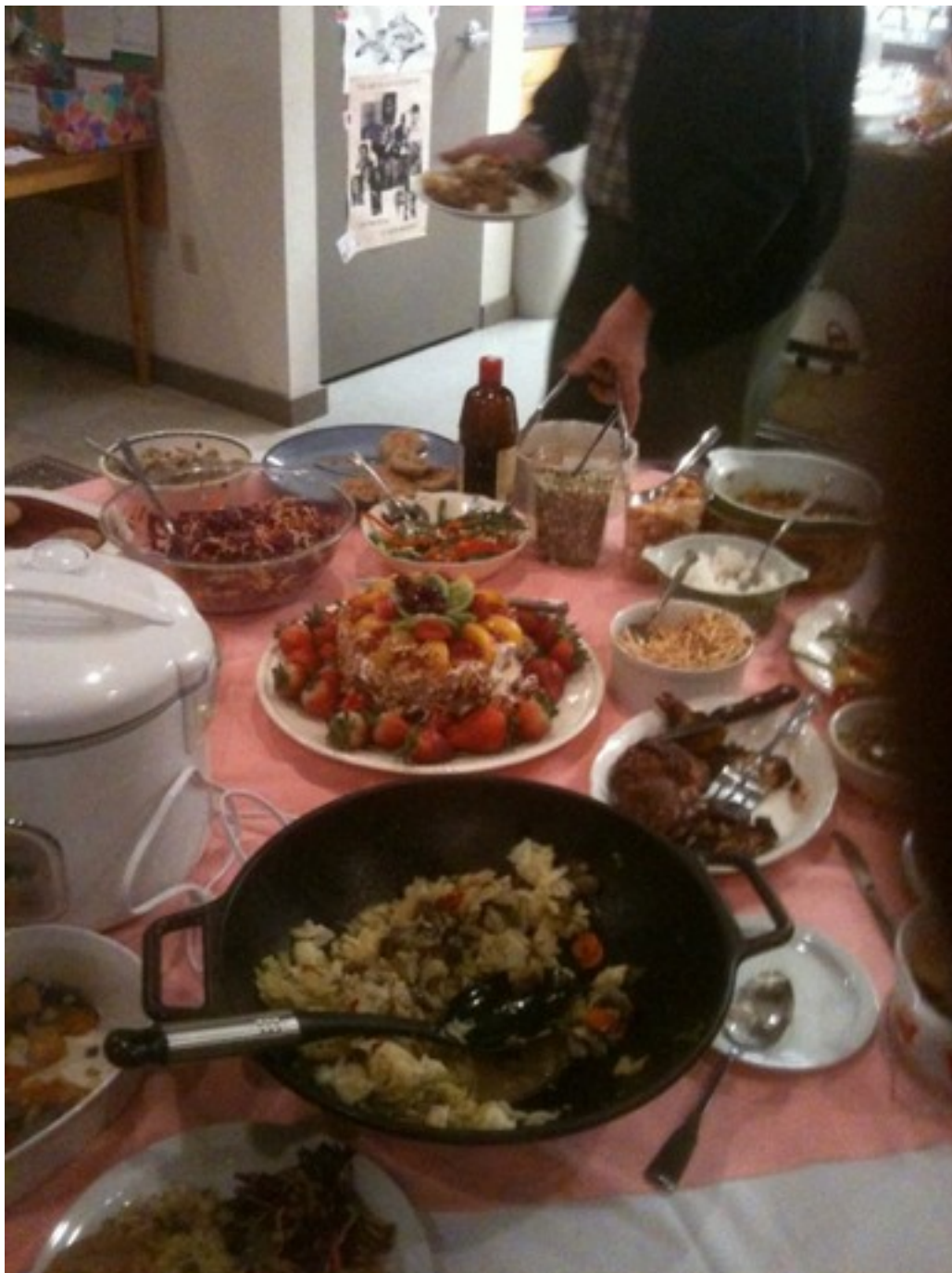
Chinese Dinner & Auction