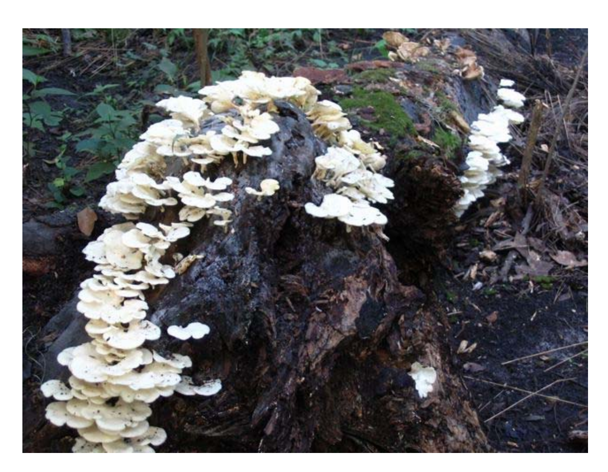
This is some bracket fungi from just east of the worship in nature area.