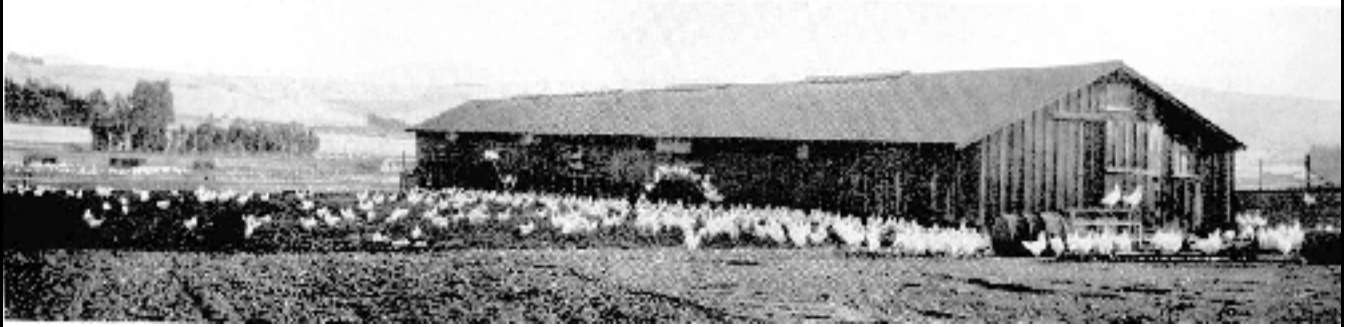
Above, a 1927 commercial henhouse in Petaluma, CA with 2,000 white leghorns. Below, various henhouses from all over.