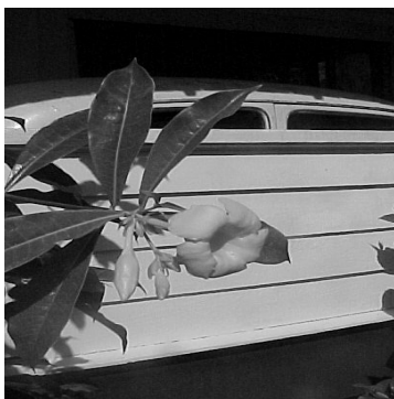
allamanda in bloom

Annual Scrub Trip (see next newsletter for further details)