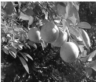
Don't forget the annual Holiday Charity Fruit Picking!