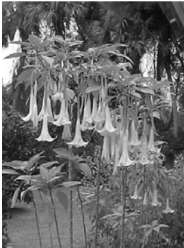
Fall Beauty at the Park