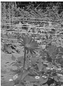
Gerbera daisy in garden