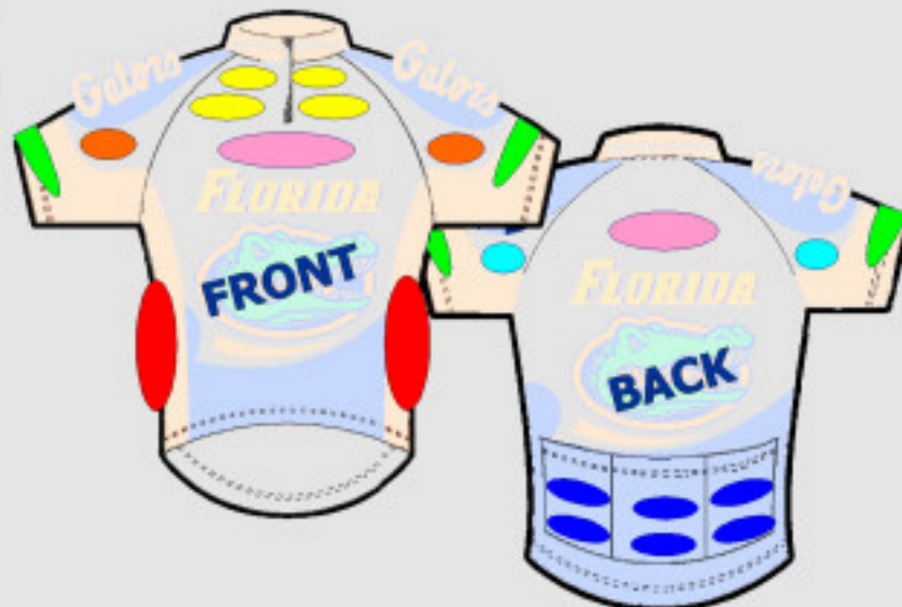
Shorts & Long sleeve Jersey pictured above