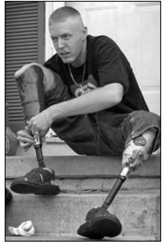
25,000 maimed and injured... ...and counting.

variety of cancers. The VA was thus forced to reverse itself and began awarding disability benefits and medical treatment to those who were fortunate enough to have survived their illnesses. Tragically, it wasn't until 2004 that a decision by the US Court of Appeals awarded disability benefits and treatment to members of the "Blue Water" Navy; those who served offshore but near enough to be affected by Agent Orange spraying along the shorelines of Vietnam.