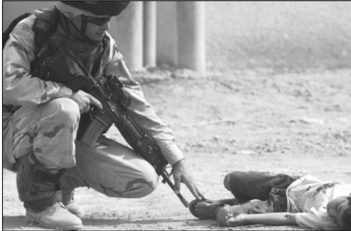
The horrors of war often come back to haunt soldiers after they have returned home.

Many veterans of the wars in Iraq and Afghanistan have already shown symptoms of post-traumatic stress disorder, most commonly known as "PTSD." PTSD has contributed to a high rate of depression and a significant number of suicides among both active duty personnel and veterans. Until the last couple of decades, PTSD was not known about nor understood by most Americans. Vietnam Veterans brought it to the public eye when many veterans were haunted by the war. Previously, this condition was called "shell shock" or "battle fatigue." The American Psychiatric Association calls PTSD an anxiety disorder. PTSD begins with an extremely traumatic event that feels life-threatening to the victim. It can be caused by extreme child abuse, a natural disaster, a serious accident, a rape, seeing somebody killed, and/or from the experience of war. Not every war veteran develops PTSD; it is hard to predict who will have problems later.