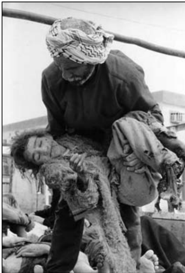
Putting a face on "collateral damage"

America's wars in the Middle East proved that the fighting and killing could begin very suddenly. You may enlist for money for college, for a job, for adventure, out of boredom or a desire to get away from home. However, once in the military you may be faced with participating in war. You owe it to yourself to think seriously about where and when it is justifiable to kill another person.