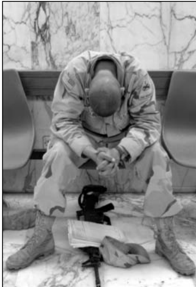
Your military service is over...now what?