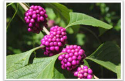
Beautyberry ( Callicarpa Americana )