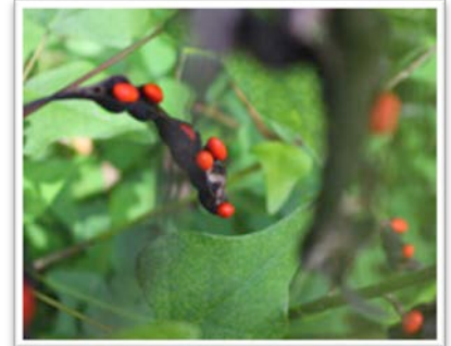
Coral bean ( Erythrina herbacea )