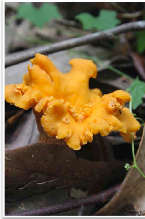
Golden chanterelles ( Cantharellus cibarius )

On our after meeting walk, Bill and I fluffed up the two remaining river oats ( Chasmanthium latifolium ) from the five that I had planted. The others