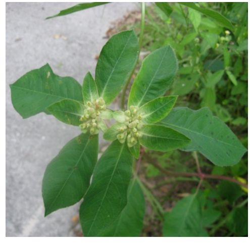
fiddler's spurge (Poinsettia heterphylla)

I have been weeding various beds around the meetinghouse and noticed that we have lots of fiddler's spurge (Poinsettia heterophylla) which may not look so much like the holiday plant, but does have similar flowers and some of its leaf bracts have diamond shaped purple spots. The other common Florida native, painted leaf (Poinsettia cyathophora) has pink or bright red on the bracts around the flowers, making it look more like the commercial poinsettia. Today I noticed that one growing up by a sweet bay magnolia on the west side of the back retention pond is as talli. I pulled several out a couple weeks ago near this tree to