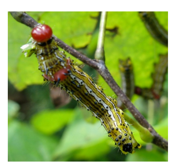
Red hump caterpillar

Two weeks ago when I went to clean the bird bath and check on